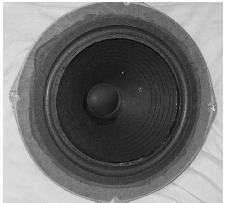
The Advent Low-Frequency Driver

The efficiency of the system has been carefully chosen to provide for reproduction of the lowest usable frequencies with amplifiers and receivers of good quality and medium power. While efficiency is lower than that of some comparably priced speakers of more limited range, and will require a slightly higher setting of a volume control for the same acoustic level, it is no more likely to tax the actual power capabilities of the amplifier or receiver used in a home. This doesn’t hold for auditoriums or, in many cases, for large (and sometimes noisy) audio showrooms, but it is emphatically so for home listening at even the highest usual loudness levels.